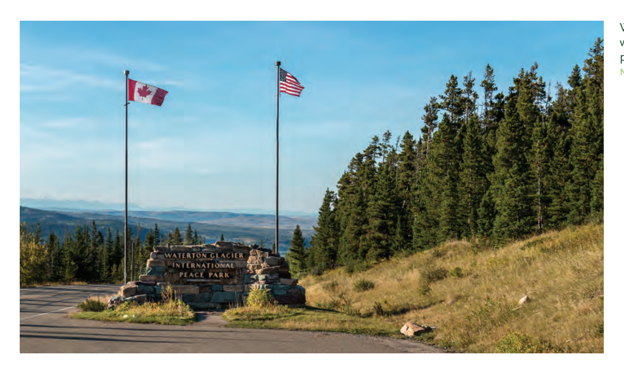
Waterton-Glacier is the world's first international peace park. NATIONAL PARK SERVICE

Wu, J. (2008). 'Landscape ecology'. In: S.E. Jorgensen (ed.). Encyclopedia of Ecology , pp. 2103–2108. Oxford, UK: Elsevier. https://doi.org/10.1016/B978-008045405-4.00864-8