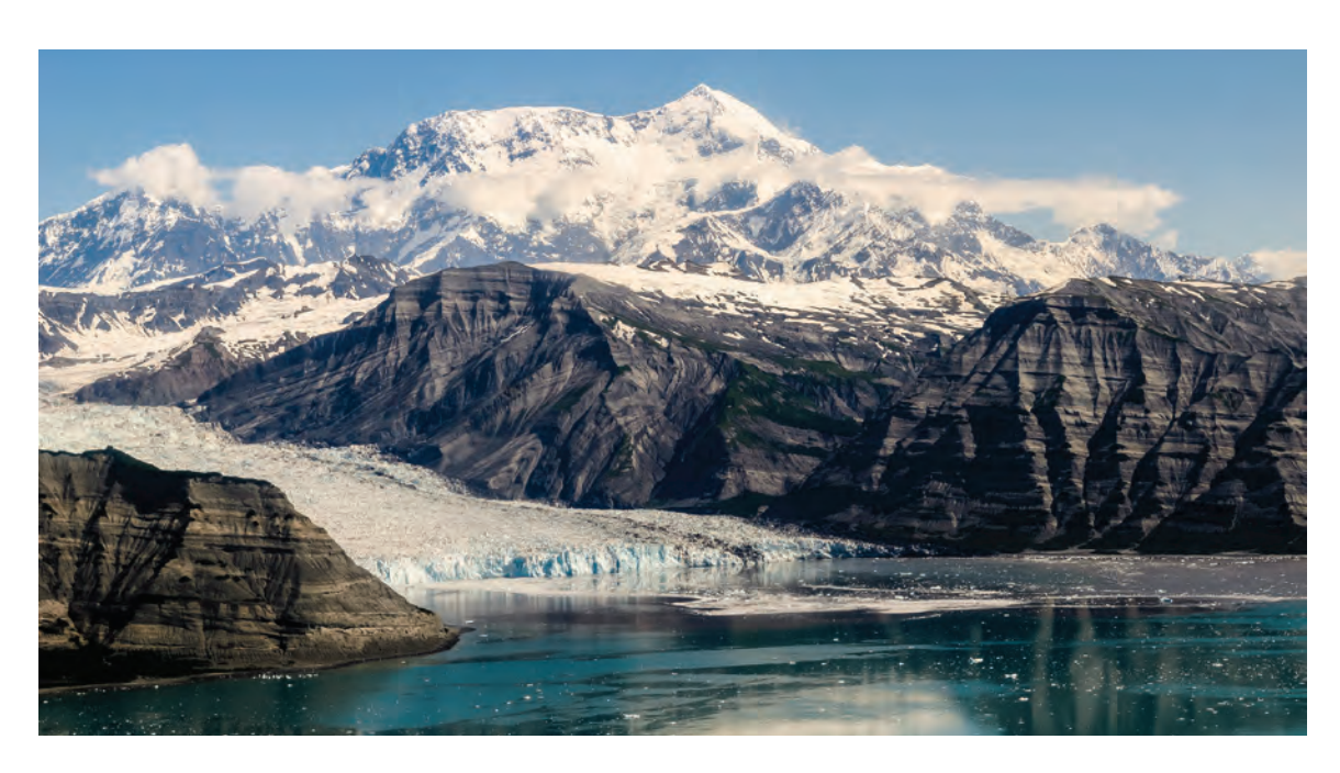
Mt. St. Elias marks the US-Canada border between Alaska and Yukon.