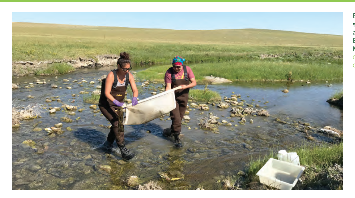
Blackfeet environmental staff conduct a water quality assessment as part of the Blackfeet Nation's Beaver Mimicry Project, 2019.

Support initiatives that provide funding sources for Indigenous-led conservation such as the IPCA Development Fund. The IPCA Development Fund is an endowment fund that will support the perpetual financing of new IPCAs and Indigenous self-determination in governing IPCAs.