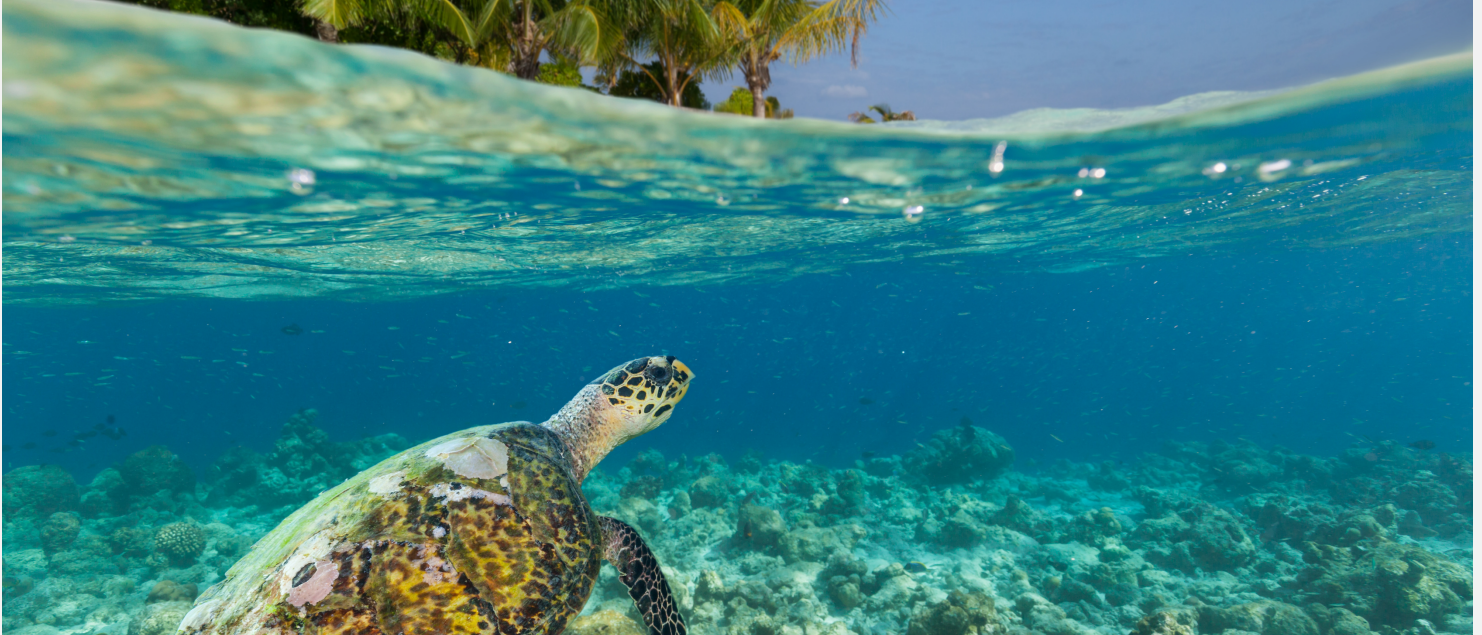
Green Turtle surfacing for air in the Maldives.