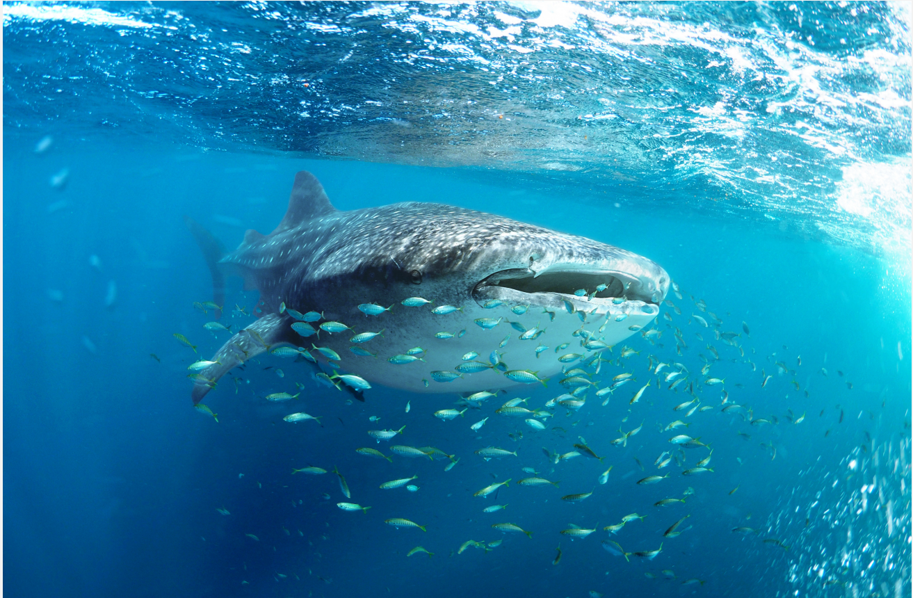
Whale Shark, a highly migratory species, seen on Ningaloo Reef, Exmouth, Western Australia.