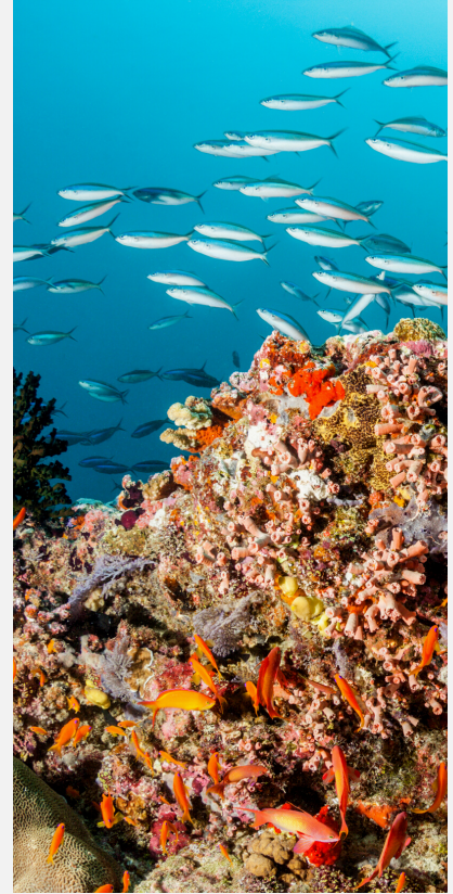
Bigeye Scad and Anthias fish on Bytes Coral Reef, Indian Ocean, Maldives.