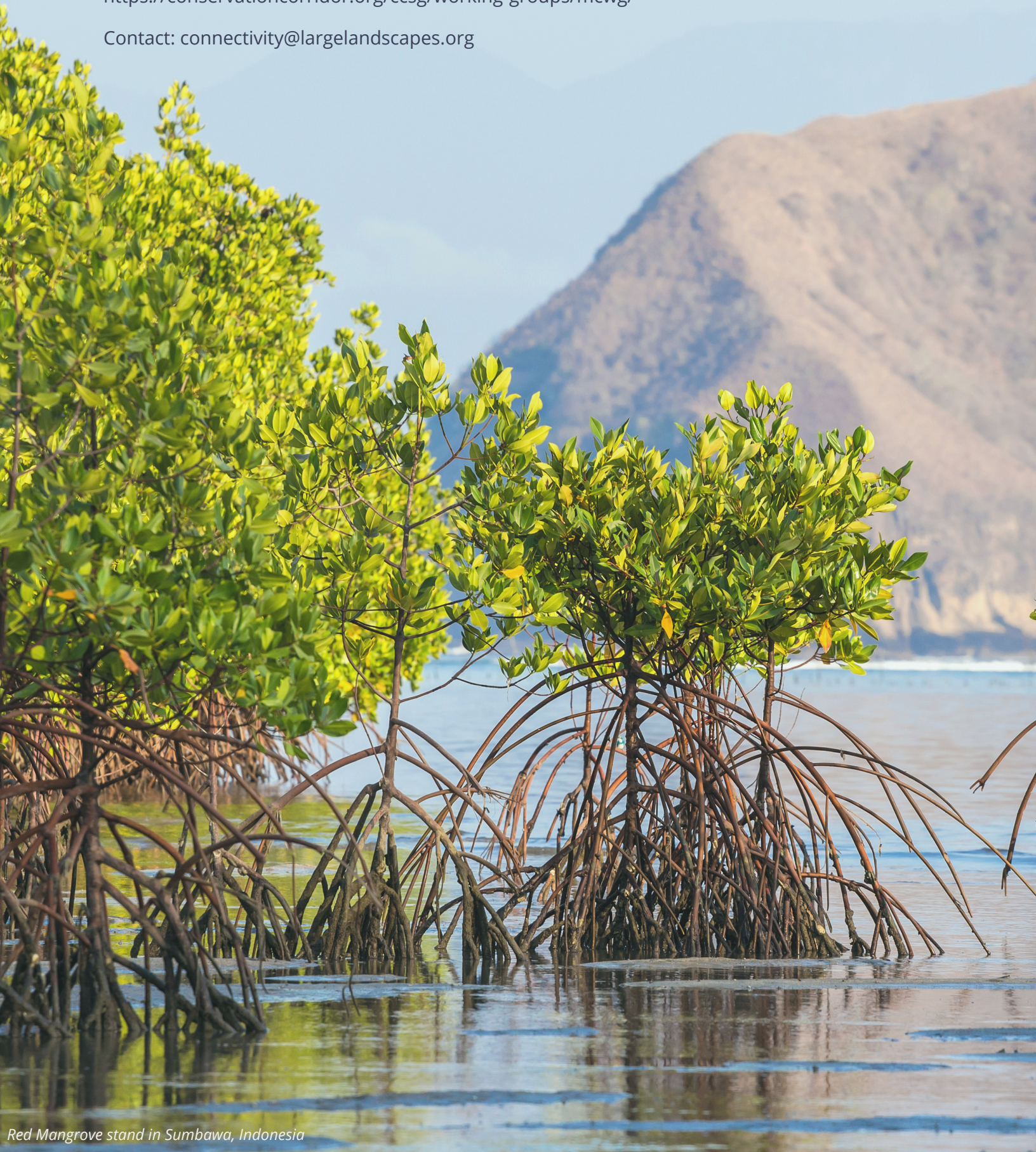
Red Mangrove stand in Sumbawa, Indonesia

Contact: connectivity@largelandscapes.org