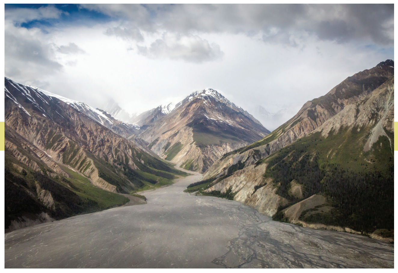
Kluane National Park and Reserve, Canada.

where conservation actions can be practically implemented to benefit a wide range of species before large-scale initiatives are enacted. Mechanisms to facilitate effective sharing of information across projects and boundaries would allow for transmission of data, methods for and results of prioritization processes, and investment strategies and actions.