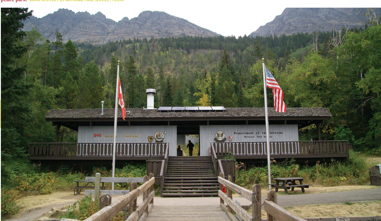
Goat Haunt Ranger Station is located on the border of Glacier National Park (US) and Waterton Lakes National Park (Canada), making it a hub of the international peace park.

At the same time, new policy opportunities for conservation have emerged in the wake of the COVID-19 pandemic. The pandemic and societal responses to it show how quickly new situations