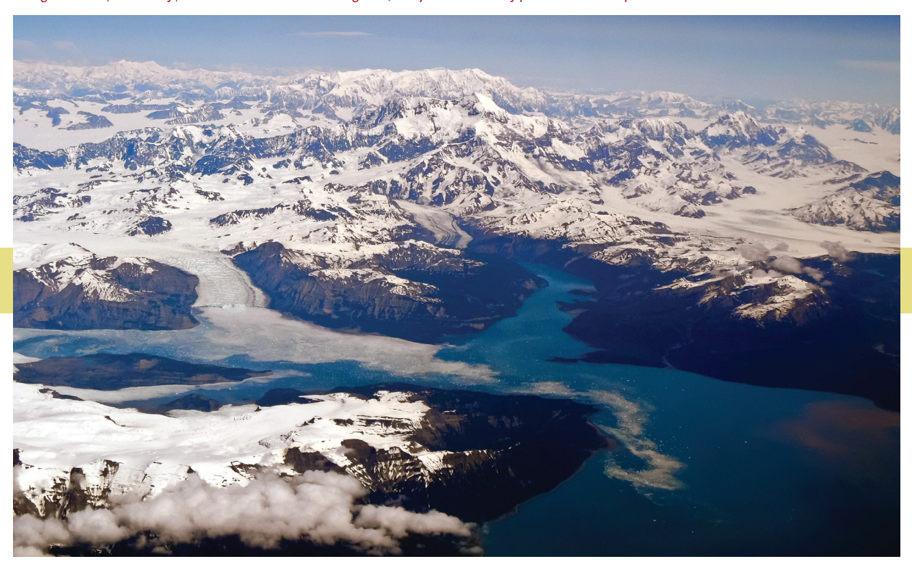
The St. Elias Range spans Wrangell-St. Elias National Park and Preserve (US) and Kluane National Park and Reserve (Canada). The parks are part of the Kluane / Wrangell-St. Elias / Glacier Bay / Tatshenshini-Alsek World Heritage Site, a major transboundary protected area complex.

The third dialogue in the series will focus on mainstreaming US–Canada transboundary connectivity conservation into sectors and society. Outcomes are aimed at identifying strategies that are grounded in regional priorities, partnerships, and opportunities.