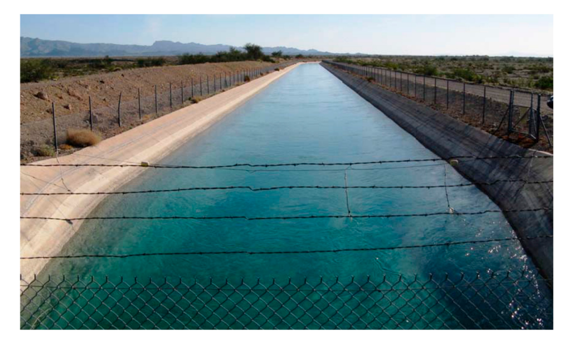
Figure 2. Canal in the Mojave Desert of California showing wildlife-proof protective fencing along the edges. Photo taken from a road across the canal.

Canals are typically a nearly-complete barrier to wildlife movement because they are often bordered by tall chain-link fences, have nearly vertical concrete sides, and are filled with swiftly-moving water that is often >2 m deep and >10 m wide. Such a configuration is almost certainly a complete barrier for all or almost all reptiles, non-flying mammals, and non-flying invertebrates (Figure 2).